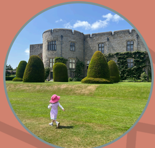
My youngest exploring the ground of Chirk Castle, Wales in 2025.

I like to think I'm relaxing, although those who know me well would say I'm far more comfortable with a to-do list in hand — staying busy and making the most of every moment.